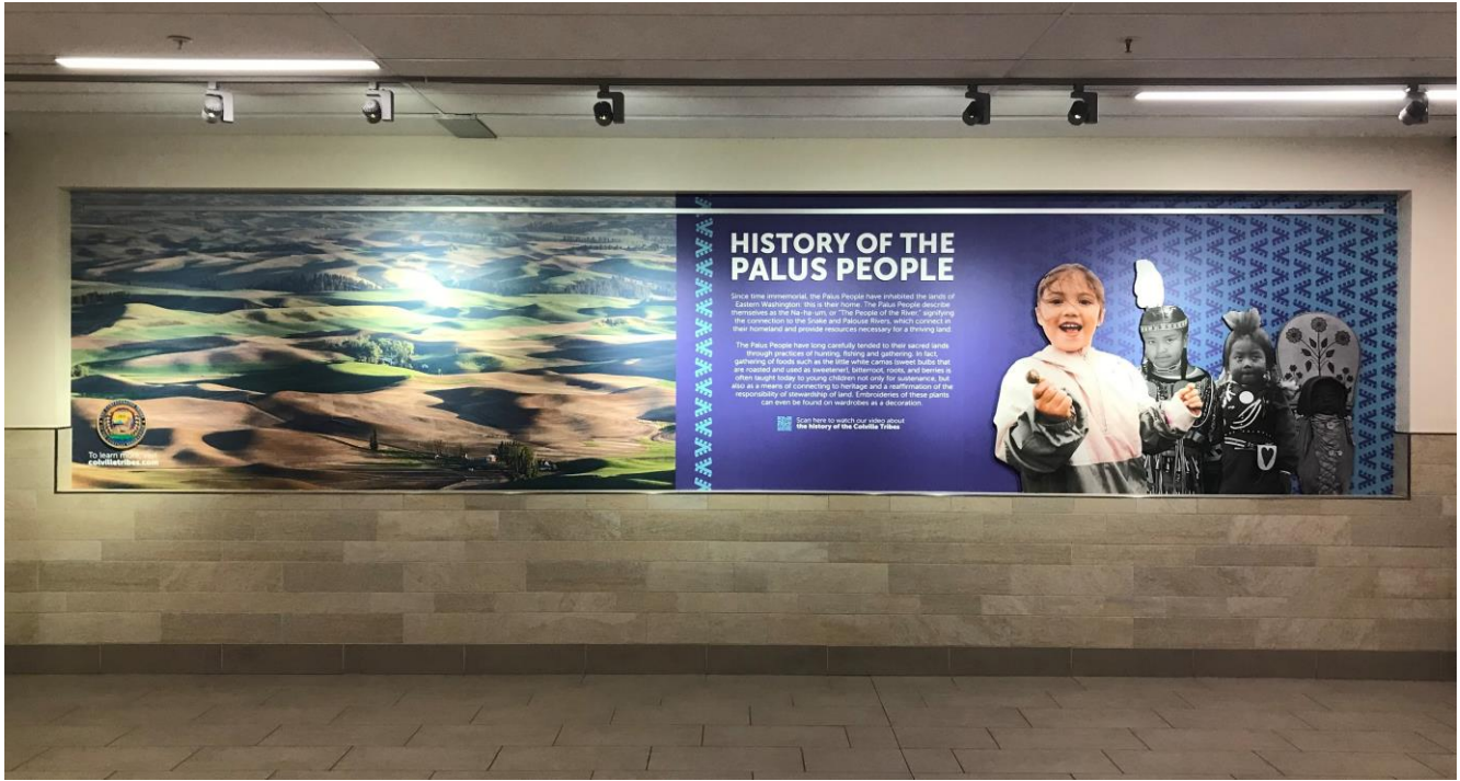
“History of the Palus People”