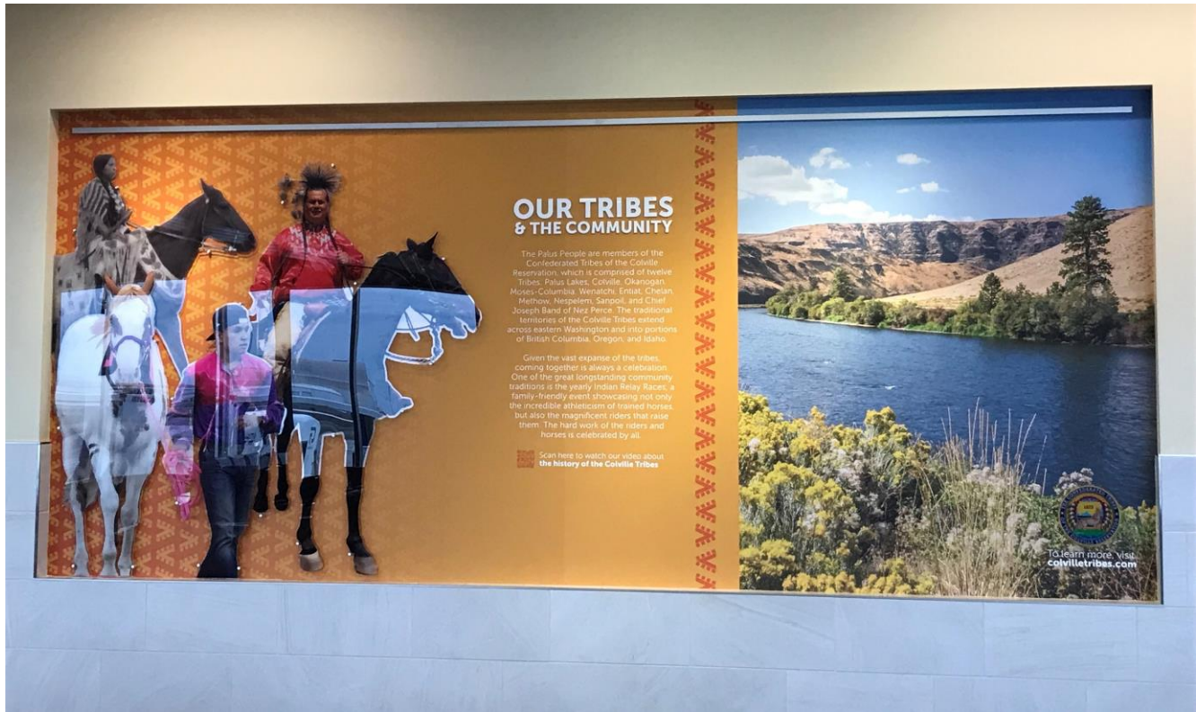
“Our Tribes & the Community”