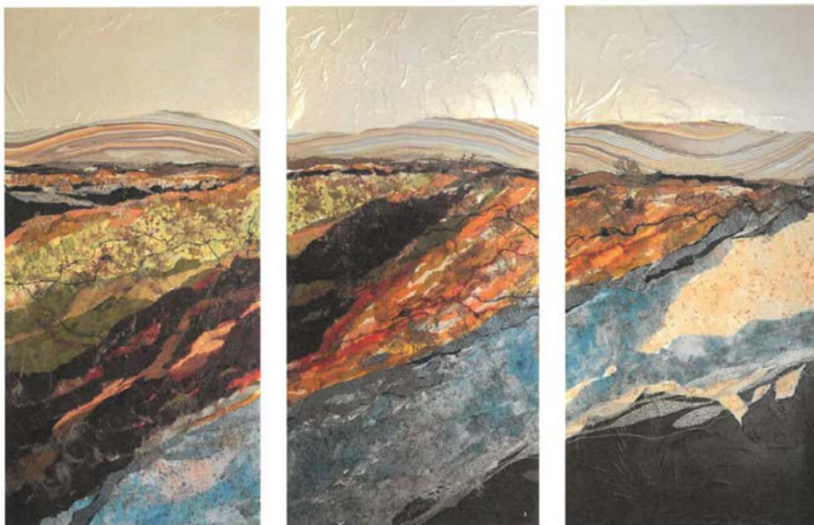
“The Three Sisters” by Malaura Bricker

Malaura Bricker : By combining her passions for paper, natural fibers, and repurposing, Malaura Bricker creates visually tactile experiences: unexpected textured collages that can be gently touched while viewing. She creates layers using sourced and artisan crafted papers with gathered flora and fiber elements, which are then repurposed into a new texture. Grasses, bark, leaves, and flowers are added to upcycled threads and strands to create works that are both aesthetically and tactically pleasing. The geography surrounding her roots in Eastern Washington inspires many of her works, including “The Three Sisters.”