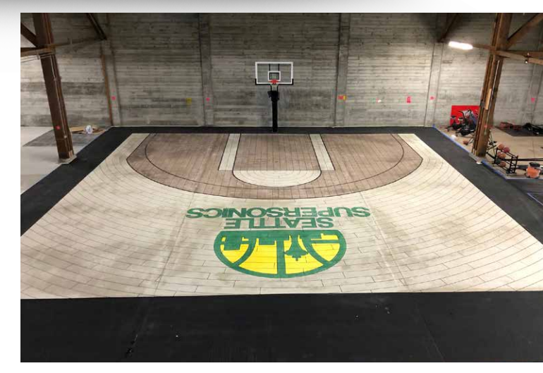
Leggari transformed part of the floor of its warehouse into an NBA regulation half-court basketball floor using their products.

They clearly have established a company meeting a need. Leggari Products has grown 400 percent each of the past four years. They ship products around the country as well as