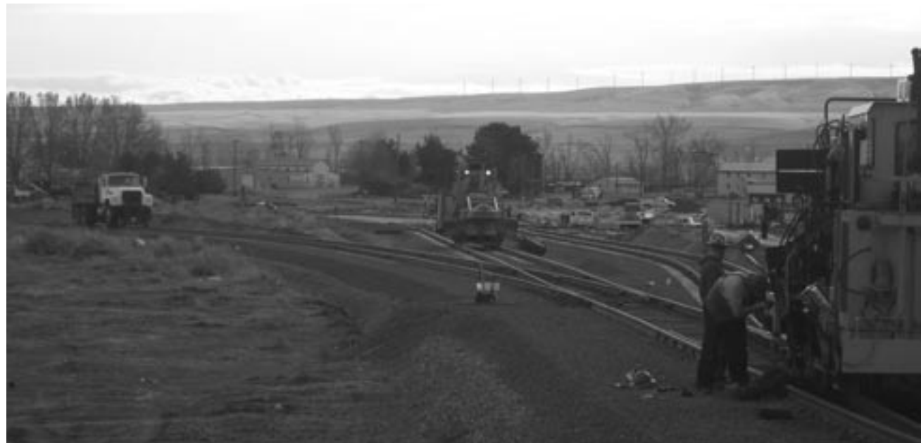
Work continues on Port of Pasco's Intermodal Transportation Terminal improvement project which, when complete, will provide important economic benefits to the region including securing and expanding rail connections for the area's export shippers.

Anchoring all these wonderments, the Port visualizes an initial "business development building" architecturally designed to set the pattern for other facilities that both enhance the surroundings and are of practical use — office buildings, laboratories, light industrial and other commercial structures, restaurants, various service outlets, water oriented facilities and the like. The total development, which will take many years, will serve Pasco, Franklin County, and, indeed, the whole Tri-Cities as the