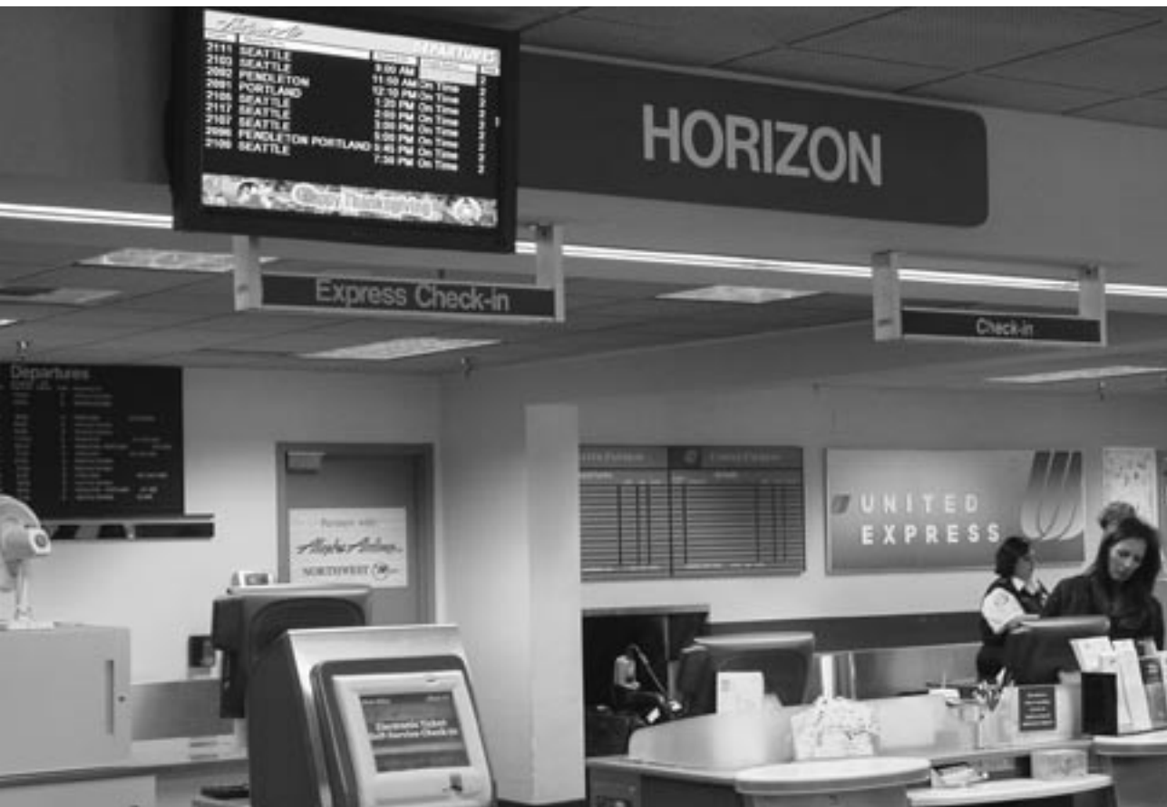
The new Flight Information Display System (FIDS) now operating at the Tri-Cities Airport provides up-to-date arrival and departure information on monitors located throughout the airport. As an additional service, the information is available 24-hours a day on the Port of Pasco's Web site at www.portofpasco.org and clicking on the Flight Info link.

(Continued from Page 1) is the construction of a new, upgraded deicing facility plus a new taxiway section. A second phase planned for 2009 will replace the last two asphalt sections. This phase is estimated to cost between $5-6,000,000. Major funding is through the Federal Aviation Administration's (FAA) Airport Improvement Program with minor matches from the airport and the Passenger Facilities Charge program.