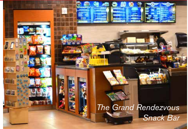
The Grand Rendezvous Snack Bar

The Native American village called Chemna, located where the Yakima River enters the Columbia, was also an established gathering spot.